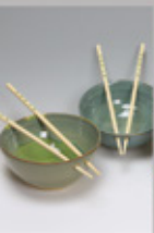
Full Moon Crafts