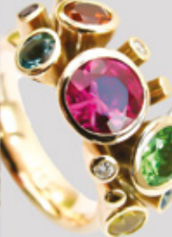
Helen Brice Designs