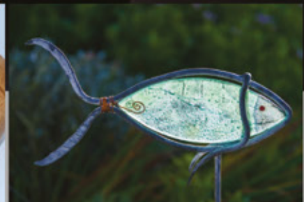
Little Duck Forge