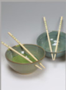
Full Moon Crafts